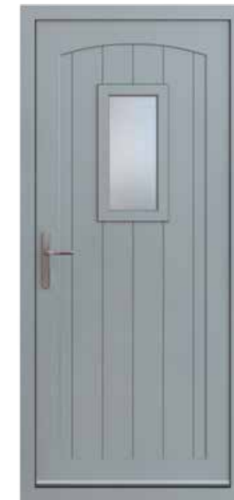
BROADFIELD | DT3002

This fabulous new back door delivers all the benefits of its front door counterparts.