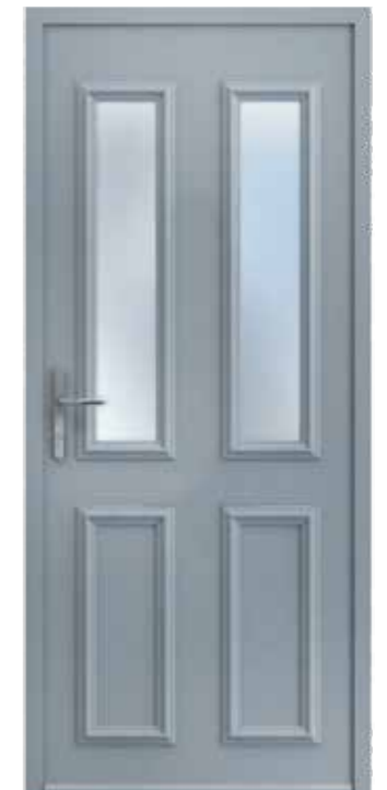
HARLEY | DT3003

The traditional Broadfield design brings a perfect country cottage look to any home.