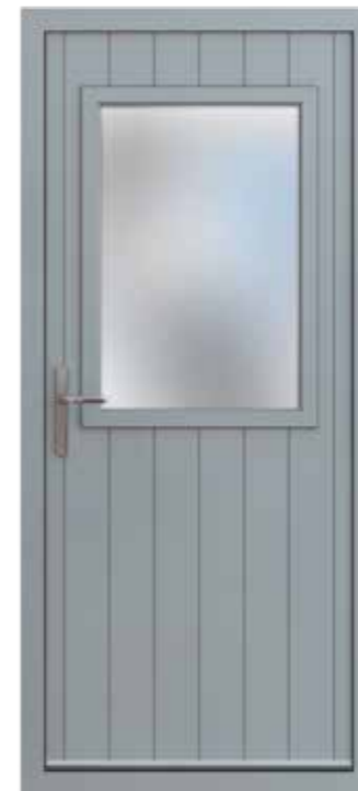
WOODCHESTER | DT3001

A timeless classic, this solid entrance door oozes understated elegance and style.