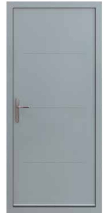
MILLBROOK | DM3003

Three glazed panels add an interesting design twist to this stylish, modern entrance door.