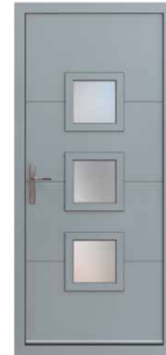
LANSDOWN | DM3002

A modern classic providing elegance and style, allowing light to flood into the home.