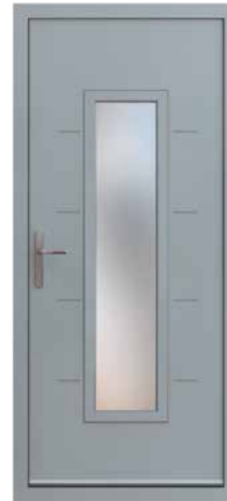
CARNABY | DM3001

From sleek and modern to timeless and classic, we've curated a variety of designs to suit every style preference while ensuring maximum security. Whether you're looking for a front or back door, our Signature Door range offers the perfect solution for your needs.