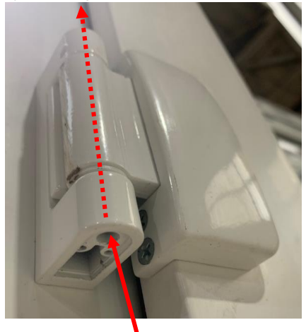
With grub screw suitably slackened off, gentlely tap pin out from underside off hinge with a suitable tool and remove pin from the top