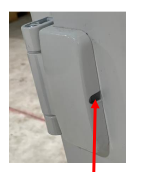
5mm Allen key gives +/- 4mm Lateral Adjustment (ON SIDE OF HINGE) Replace cover caps when adjustment is finished

5mm Ällen key gives + 4mm Height Adjustment (ON TOP OF HINGE) Replace cover caps when adjustment is finished